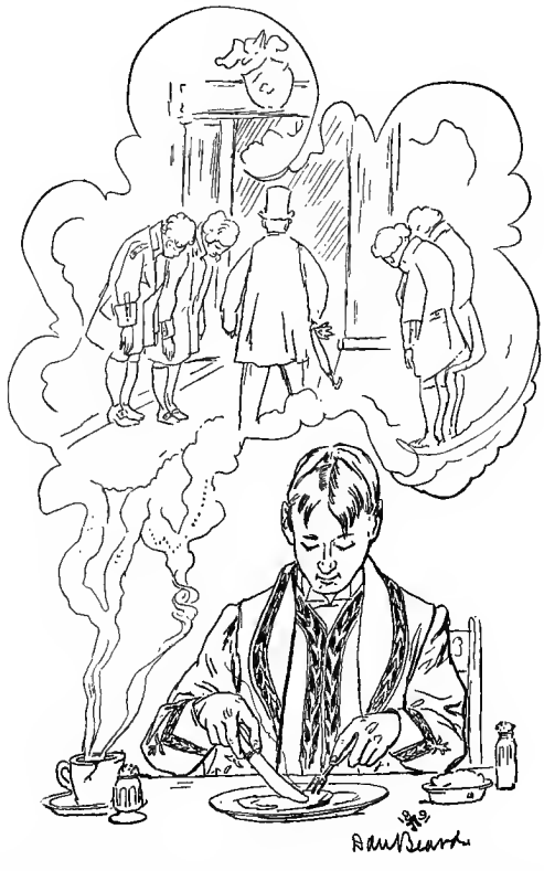
"HIS THOUGHTS HAD BEEN FAR AWAY FROM THESE THINGS."

to such a degree that he couldn't contemplate another visit there with anything strongly resembling delight. In fact he was a little ashamed to go; he didn't want